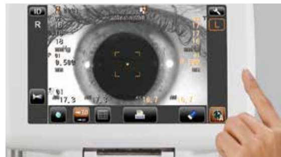
*The picture is CT-800

The CT-800 and CT-800A are equipped with a 8.5 inch wide colour touchscreen panel featuring clear, comprehensible icons, enabling easy control of the unit during the measurement process.