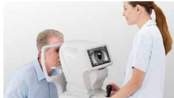
*The picture is CT-800A

The operator simply follows the initial alignment guidance on the monitor, then alignment and measurement take place automatically.